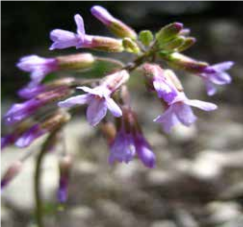
Cathy's research focuses on hybrid apomicts in the genus Boechera. An example of one is shown here, likely involving parental species B. sparsiflora and B. retrofracta.

and asexual reproduction are maintained at the population level in nature, and I'm lucky enough to have a great study system to address these questions in the field.