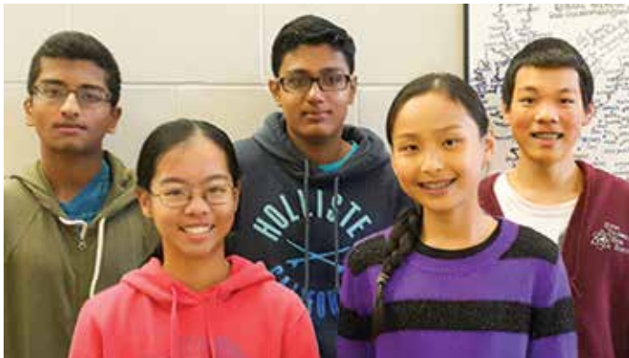
PlantingScience star project winning team “The Bio Bunch” tackle iris seed germination research project.

If you would like to be a PlantingScience mentor and help student teams discover the joy of scientific discovery and become fascinated with plants, we are now recruiting mentors for the fall session (mid September – mid October). Register any time at plantingscience.org/newmentor .